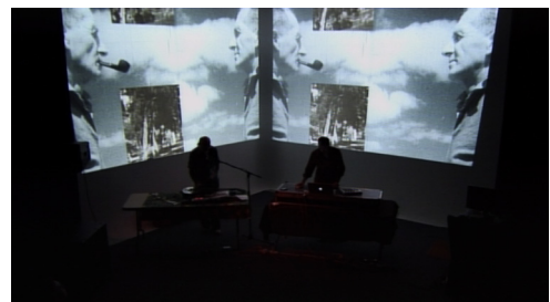
Materials in "Outback and Beyond" appear courtesy of the National Film and Sound Archive, Frontier Services and the John Heyer Estate.