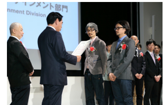
Awards Ceremony of the 16th festival

(* Certificates from the Minister of Education, Culture, Sports, Science and Technology)