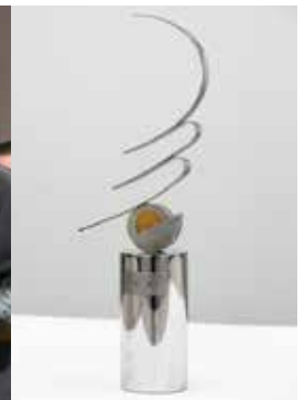
Japan Media Arts Festival Trophy

Grand Prize: Certificate*, trophy, 600,000 Japanese Yen Excellence Award: Certificate*, trophy, 300,000 Japanese Yen New Face Award: Certificate*, trophy, 200,000 Japanese Yen Special Achievement Award: Certificate*, trophy