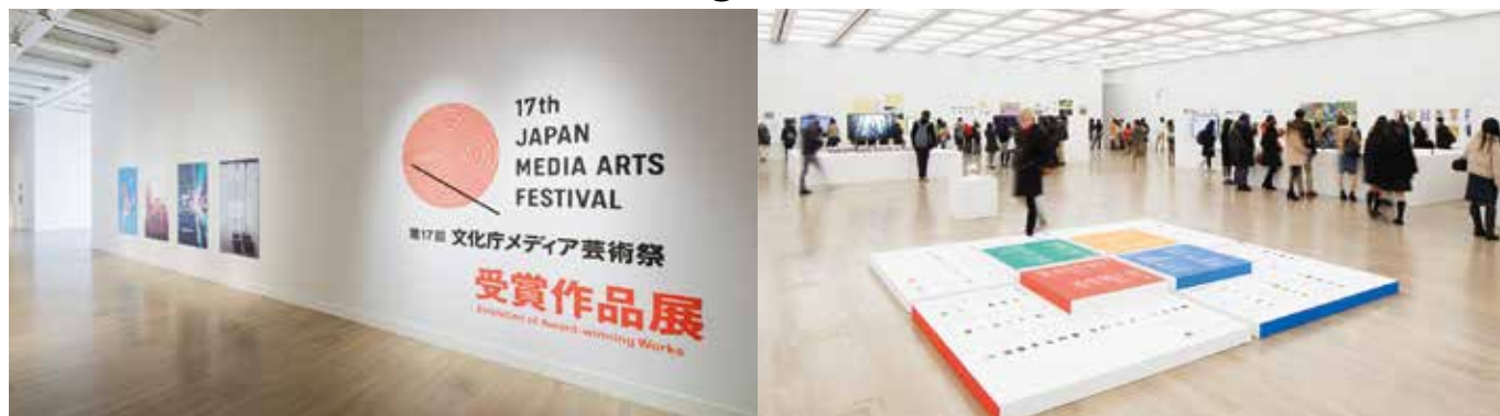
Exhibition of Award-winning Works / 17th Japan Media Arts Festival, 2014.

■ Period: Wednesday, February 4 - Sunday, February 15, 2015