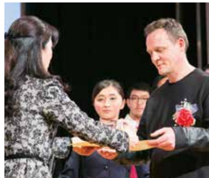
17th Japan Media Arts Festival Awards Ceremony

For each Division, the Awards (Grand Prize, Excellence Awards and New Face Awards) will be awarded on the basis of artistic quality and creativity. In addition, Special Achievement Awards will be awarded on the recommendation of the Jury to an individual or group who has made a special contribution to Media Arts in any of the four divisions.