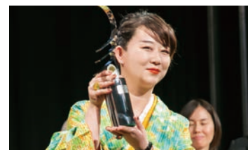
Image from the 19th Japan Media Arts Festival, 2016

*Certificates will be presented by the Minister of Education, Culture, Sports, Science and Technology